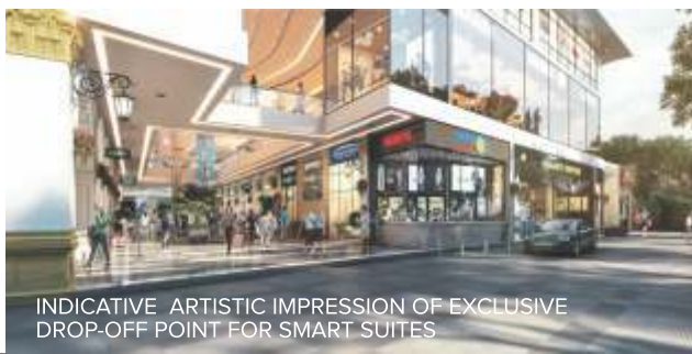
INDICATIVE ARTISTIC IMPRESSION OF EXCLUSIVE DROP-OFF POINT FOR SMART SUITES